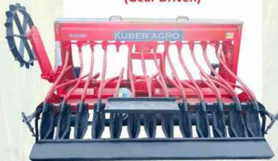
Kuber Superseeder (Gear Driven)