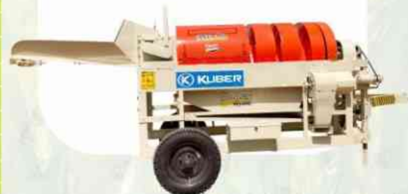
Kuber Multi Crops Thresher