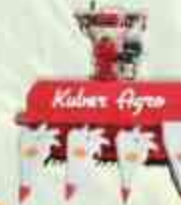
Hand Weeder Reaper