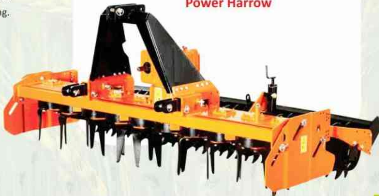
Kuber Power Harrow