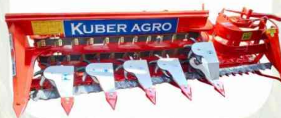
Kuber Reaper Binder